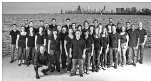
CHICAGO CHAMBER CHOIR