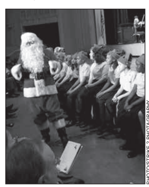
A VISIT FROM SANTA, ALONG WITH THE EVANSTON CHILDREN'S CHOIR

Make sure your holiday season starts with the best holiday event in Evanston!