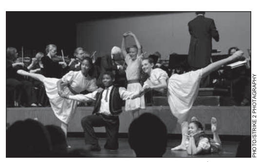
EVANSTON DANCE ENSEMBLE DANCES TO TCHAIKOVSKY'S NUTCRACKER SUITE WITH THE EVANSTON SYMPHONY ORCHESTRA

The Evanston Symphony Orchestra's wonderful holiday concert is getting even better this year. Not only will we hold a magical concert on December 8, but we are also hosting a Holiday Bazaar, featuring local artists, artisans, and local businesses.