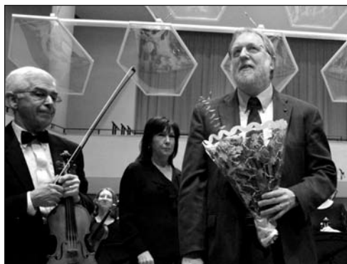
JOSEPH SCHWANTNER, COMPOSER, TAKES A BOW

The sold out February 8, 2009 ESO concert featured music by American composers and was attended by Pulitzer Prize winning composer, Joseph Schwantner, through a grant from the Ford Made in America (FMIA) project, and composer and violin soloist Mark O'Connor. On February 6 and 7, Mr. Schwantner made presentations to over 300 area junior and senior high school students on the creative process of musical composition through a coveted FMIA sponsored residency granted to the ESO. Simultaneously, Mr. O'Connor led a workshop sponsored by the American String Teachers Association with scores of local string players hosted at Midwest Young Artists headquarters in Highwood.