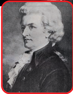
Wolfgang Amadeus Mozart